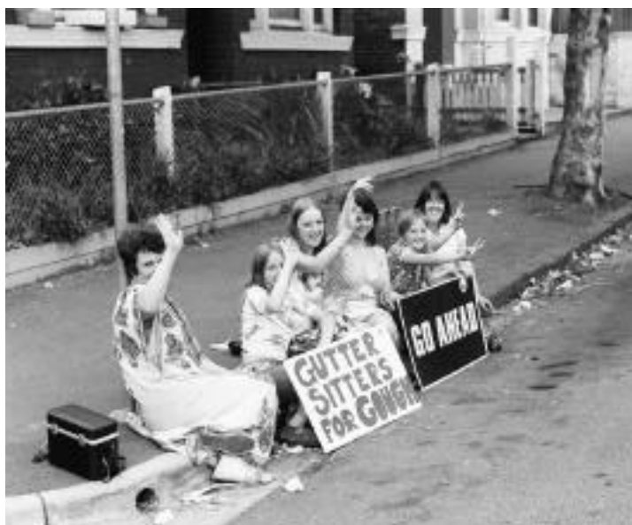
One of the many 'street politics' images from the Ellis Collection – taken during the federal election campaign, in St. Kilda, November 1975 (Neg. no. 85).

The protest march has replaced the queue as Britain's favourite communal activity. It's lively, it's an outlet for aggressive instincts, and it gives one something to do on a rainy day. Not least it's a good way of meeting the opposite sex. Hyde Park rallies, in particular are noted for being a more than satisfactory substitute for the old Palais de Danse.