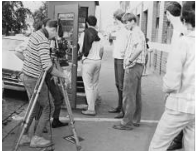
Production still, probably from That Green Carnation, short film c. 1967, made for a dental students review.

The University Archives also holds a number of MUFS production unit titles on 16mm film and video, including at least one title, Royal Rag (a fascinating record of Prince Phillip's visit to the University in 1954), which is unique to the Archives. This is part of the Archives' considerable audio-visual collection, which is little known and at odds — as are the MUFS papers as a whole — with its presumed place as only a repository for 'dusty old files'. ❖